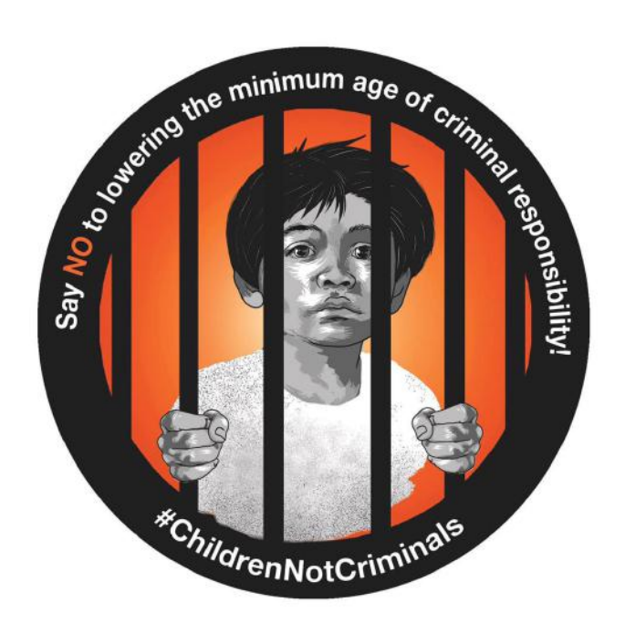
Figure 5. CRN's #ChildrenNotCriminals Campaign

CRN deployed this calibrated narrative using memes, images, and celebrity advocacy across multiple platforms. They avoided the trap of personality-oriented attacks against Duterte and legislators while correcting various "fake news" and disinformation around "tambays" (bystanders) and "pasaways" (disobedient citizens) by using emotionally