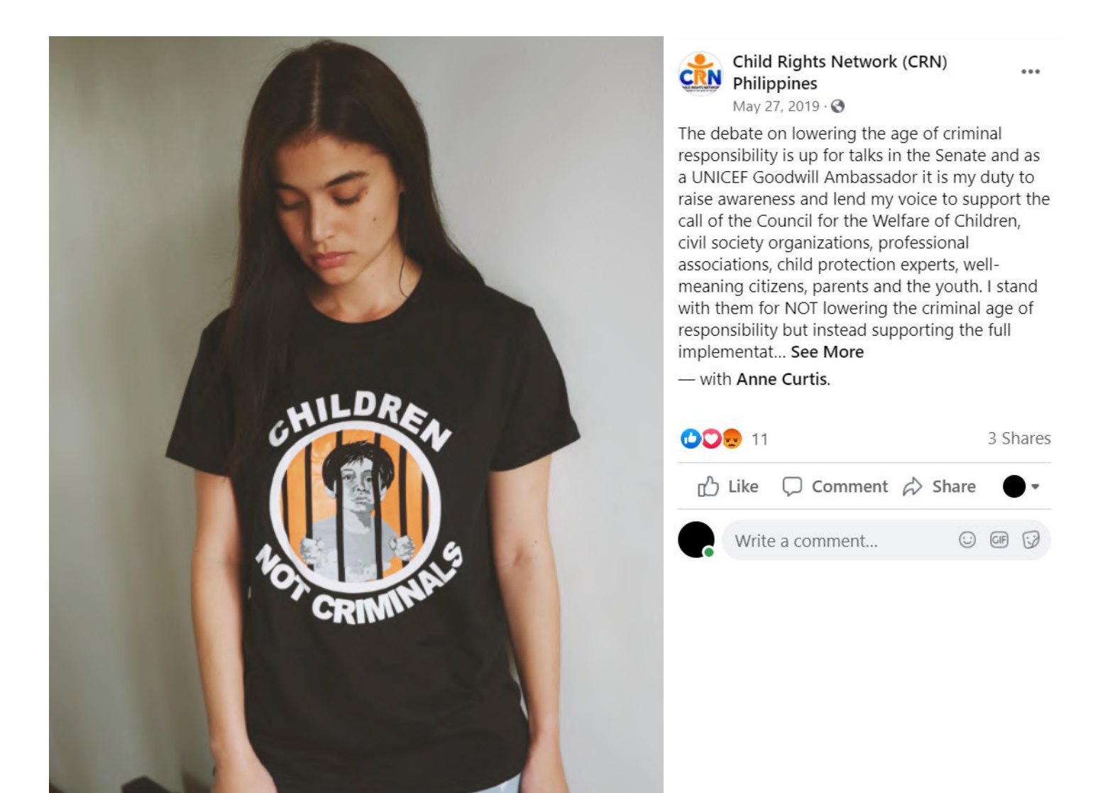
Figure 6. UNICEF Goodwill Ambassador Anne Curtis's Solidarity Post for CRN's Campaign against Lowering the Age of Criminal Responsibility