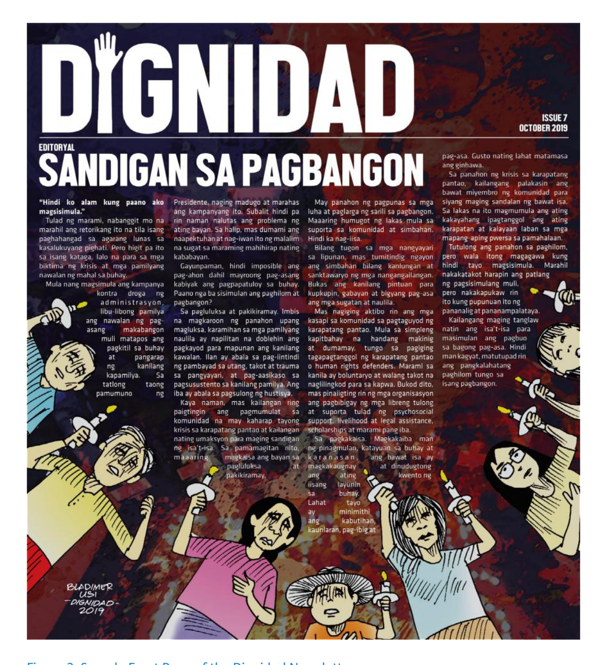
Figure 2: Sample Front Page of the Dignidad Newsletter

As EJK survivors become empowered, these activities potentially yield long-term impact for the human rights sector's ability to expand its reach. However, the trade-off of this approach lies in its limited scale. Given that direct community engagements entail substantial time and resources, it would be challenging for human rights organizations to replicate these approaches in the many communities where human rights violations are rampant.