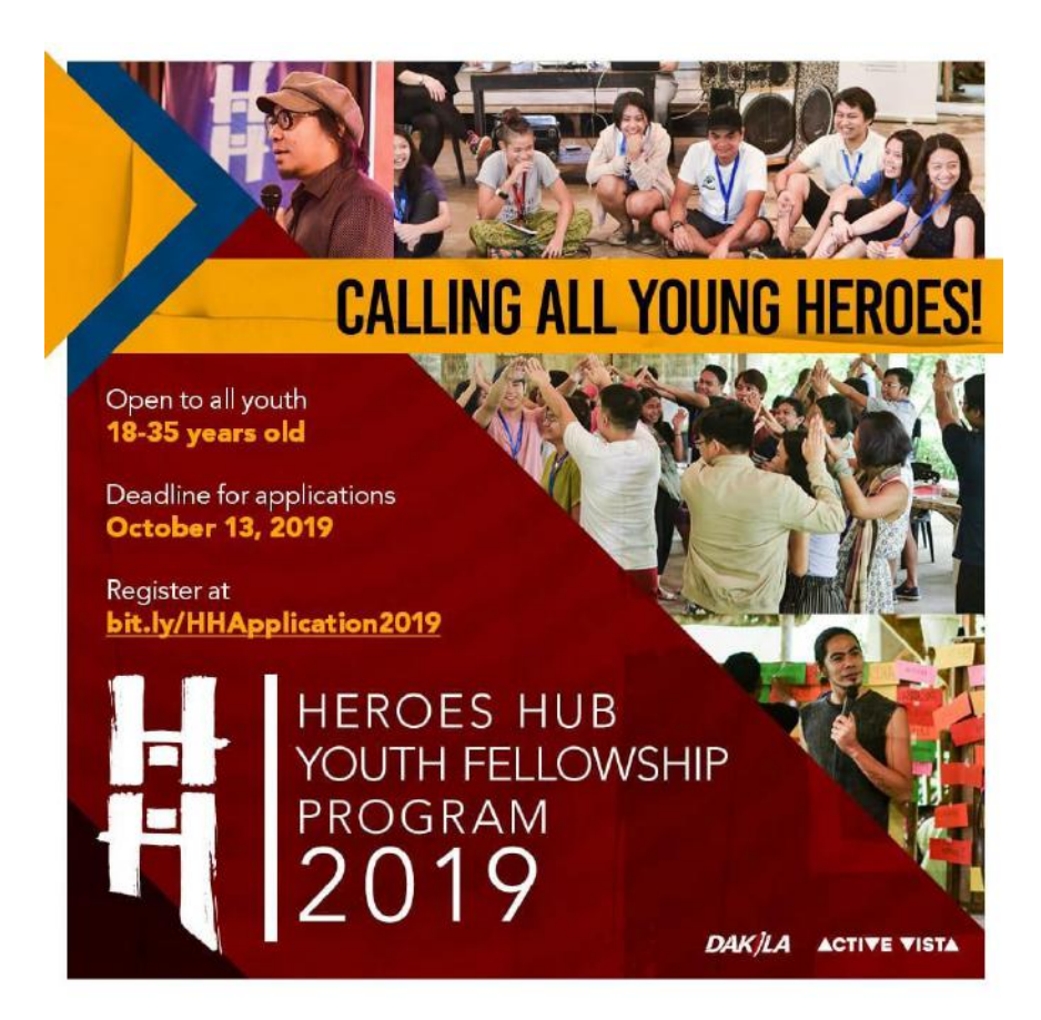
Figure 4: Active Vista's Heroes Hub

Active Vista also advanced cinema for social change by supporting the production of original documentaries such as On the President's Orders and public screenings of socially relevant films such as Heneral Luna. Active Vista pointed to a public statement from Presidential Spokesperson Salvador Panelo that their documentary is "overdramatized" and "reeks with malice" as evidence of project impact.