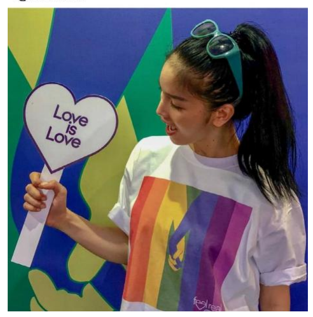
Figure 3: Unpaid Posts by Celebrities and Performers for the "Love is All We Need" Campaign

@joelvillanueva @mannypacquiao @helenstito