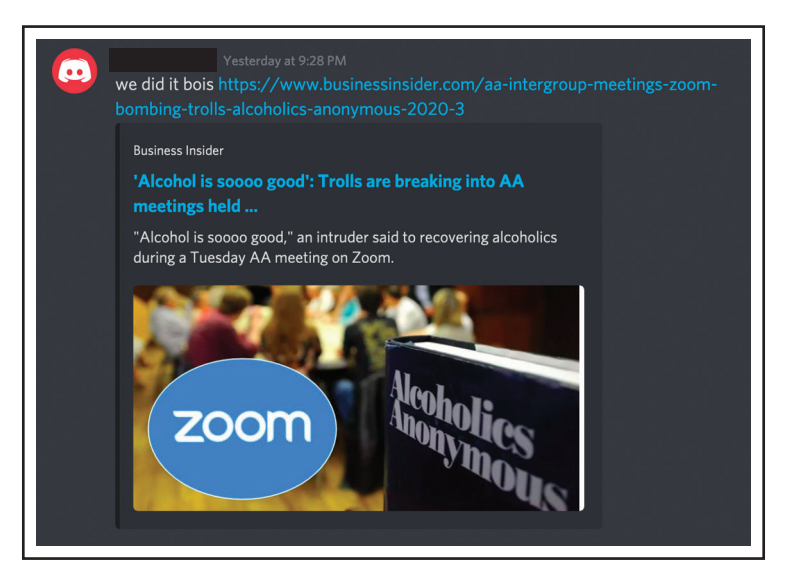
This is a post from a Discord server celebrating critical press coverage of a

Service, and we removed the servers as soon as we were made aware of them,"27 the company said in a statement to PC Magazine on March 31. Much of the pressure on platforms to act on terms of service (ToS) violations comes from critical press, but press attention delights trolls. They see negative press attention as a trophy and sign of victory. Articles such as the one pictured to the right are commonly shared within Zoom-bombing Discord servers. It is clear from our research that Discord is a favorite place to coordinate and celebrate Zoom raids.