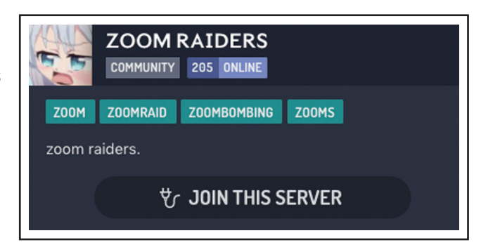
This is one example of a public Zoom-raiding Discord server accessed via disboard.org.

In our research, we have observed several Discord servers where people share Zoom links, and many new servers created solely for coordinating Zoom bombings. Using names like "Zoom support," these servers were set up recently to take advantage of the Zoom bombing phenomenon. Discord servers created for trolling purposes are hardly new, though these dedicated Zoom groups are a result of the popularization of Zoom bombing online. By using