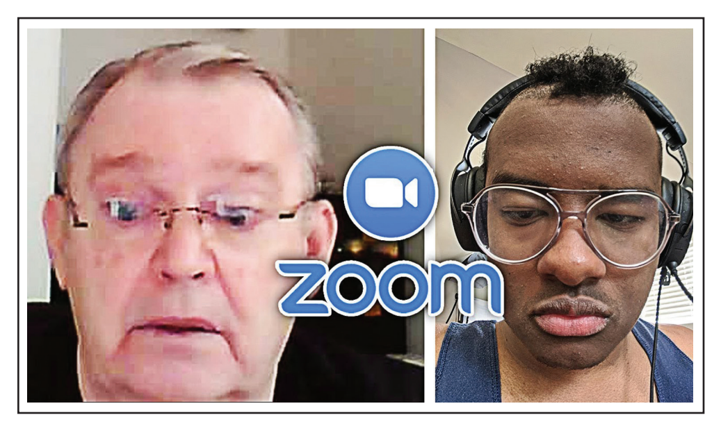
This is a thumbnail image for a twomad YouTube recording of Zoom bombings.

Zoom bombing has since hit Narcotics Anonymous gatherings, virtual classes, and even government meetings. While much of the focus has been on Zoom itself, the campaigns are carried out using multiple platforms and are the product of sociocultural and technical conditions. This paper seeks to shed light on these processes and offers a more comprehensive and nuanced explanation of the vulnerabilities that drive Zoom bombing.