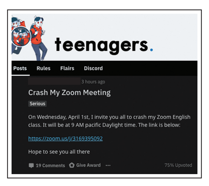
This is an example of a Reddit post soliciting readers to raid a Zoom class.

Reddit is a popular news-sharing and discussion platform founded in 2005. All manner of interest groups use Reddit to share information and tips, and host political discussions. In some subreddits, like Teenagers, users have shared Zoom links for potential bombing. However, this content is usually quickly removed by site moderators as it clearly violates ToS. In fact, the majority of conversations about Zoom on Reddit occur among the adult user base. They share experiences of being Zoom bombed, and tips for how to prevent it from happening to others. The use of Reddit to coordinate is likely a marginal part of Zoom bombing, as active community